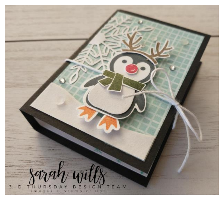
By Sarah Wills www.SarahsInkSpot.com